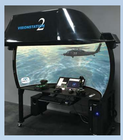
VS2 Desktop Role Player/Pilot Station