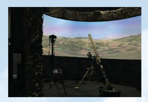
Emulated Military Equipment

Joint Fires Training has become a major focus in the collective unit capability of today's fighting forces. The mission takes more than just the "Cleared Hot" and "Fire for Effect" to be successful... the Collective Unit Training System (CUTS) from IDSI utilizes a progressive design approach to modular and scalable training curriculum by integrating BSI Modern Air Combat Environment (MACE) with the MetaVR Virtual Reality Scene Generator (VRSG) in a range of Immersive Display Solutions' dome and cylindrical visual systems to produce a progressive, interoperable distributed training environment for both individual and collective training.