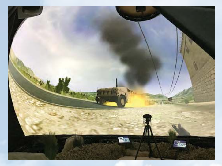
CUTS 605 JTAC Trainer