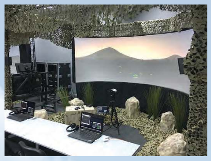
CUTS 400 Classroom